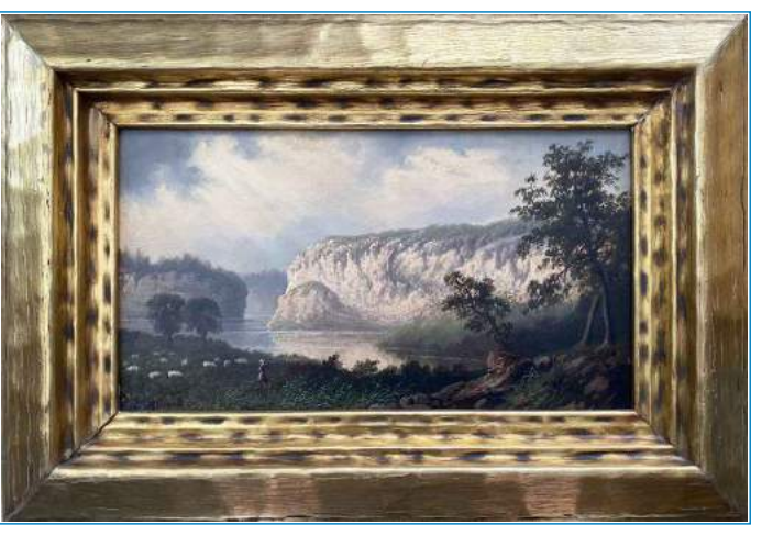
<u>Untitled (River Scene) by Henry Vianden</u>

Oil on canvas, 20 x 30 in., Frame: 30 x 40in