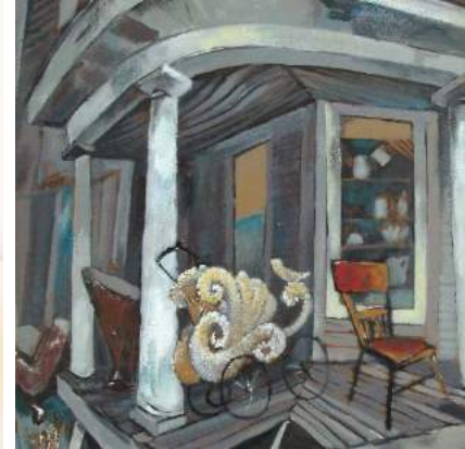
Doris White, Untitled (Thorp), watercolor, full size Robert Schellin, Small Ceramic Bowl, 5 \times 4.5 \times 20 \times 27.5