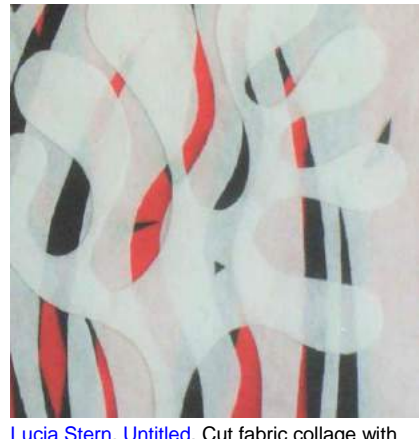
<u>Lucia Stern, Untitled</u>, Cut fabric collage with stitching, 13" x 10"