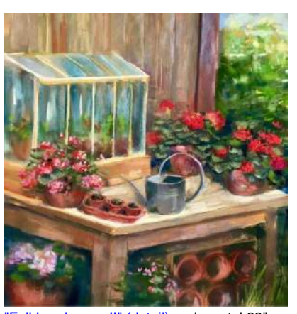
pastel, 23" x 23.5

Carol Rowan (1938 - 2012) lived and worked on the east side of Milwaukee, where she transformed her surroundings into pastels filled with color and light.