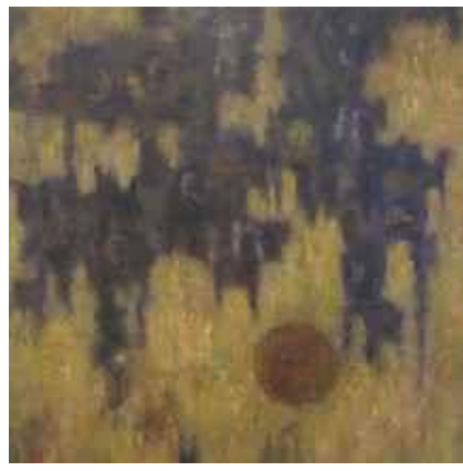
Fred Berman, "Falling Sun IV",1959, oil on linen, detail 55 x 42