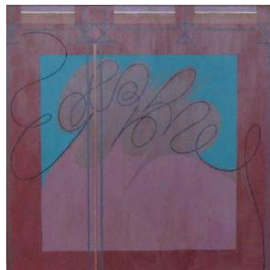
"Special Noren", n.d. acrylic on board, 35" x 35" "Water Music", embossment, n.d. 15" x 13.5"