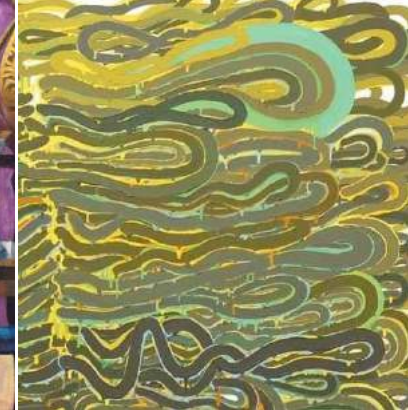
detail. 56 x 68.

Three Generations of Abstraction: Santos Zingale (1908 - 1999), Joseph Berman (1926 - 2011), and Richard Lazzaro (b. 1937). This fascinating exhibit will showcase tour-de-force paintings of three of Wisconsin's most important artists. Their work celebrates the imaginative freedom of abstraction developed during the 20th century. Each creates innovative works applying aesthetic sensibilities evolving within their decade and beyond nurturing their individuality.