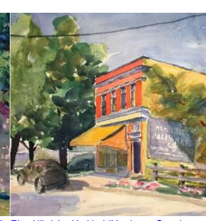
Elsa Ulbricht, Untitled (Hardware Store), Watercolor on paper, 13 x 18

The Gallery of Wisconsin Art CONSIGNS, SELLS and BUYS artwork by early Wisconsin artists!