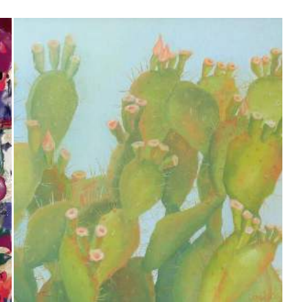
Thomas Kulich, "Jill's Garden", Mixed media, 36" x 36"